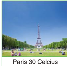
Paris 30 Celcius